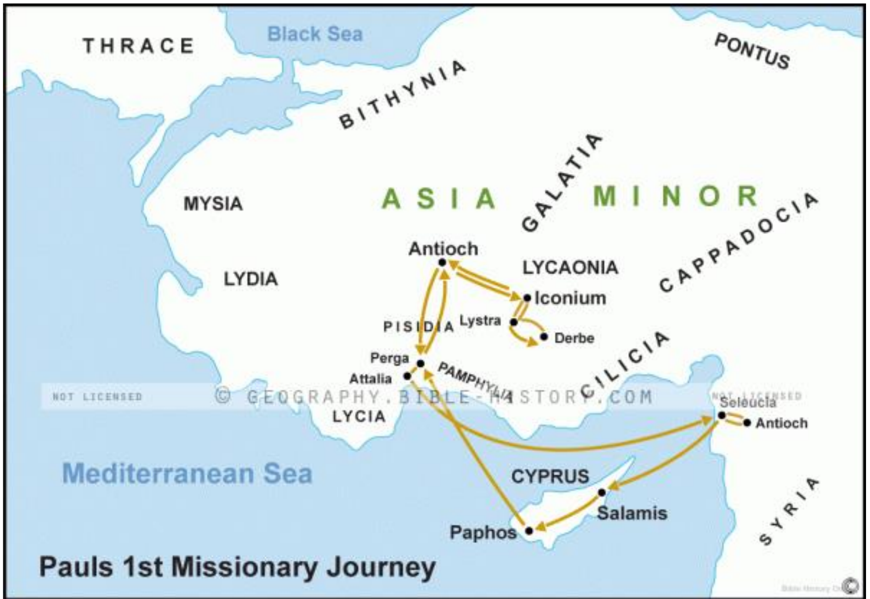
Pauls 1st Missionary Journey